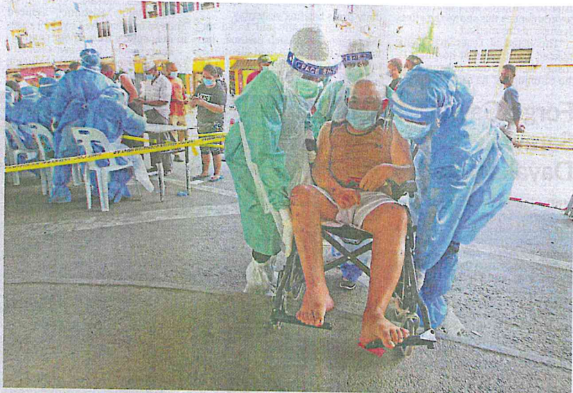
Easy does it: Healthcare workers carrying a disabled man up a step for a Covid-19 test at Pudu market in Kuala Lumpur.

"Fasting in Ramadan and serving the people in need while on full PPE suits. Indeed, you guys are our heroes," he wrote.