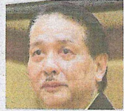
Dr Noor Hisham Abdullah

"Kita sudah kenal pasti yang positif dan mengambil tindakan diperlukan untuk mengekang penularan. Setakat ini kita dapat kawal kluster itu dan berharap tiada pertambahan kes baharu di-