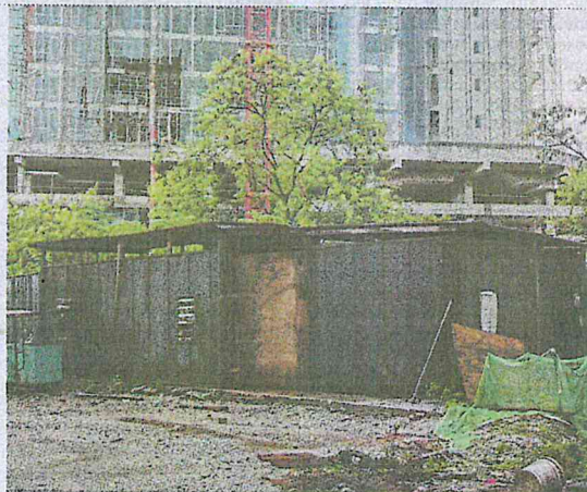
A migrant workers' living quarters near a construction site in Kuala Lumpur.

As for the chicken factory cluster, he said, the factory had been