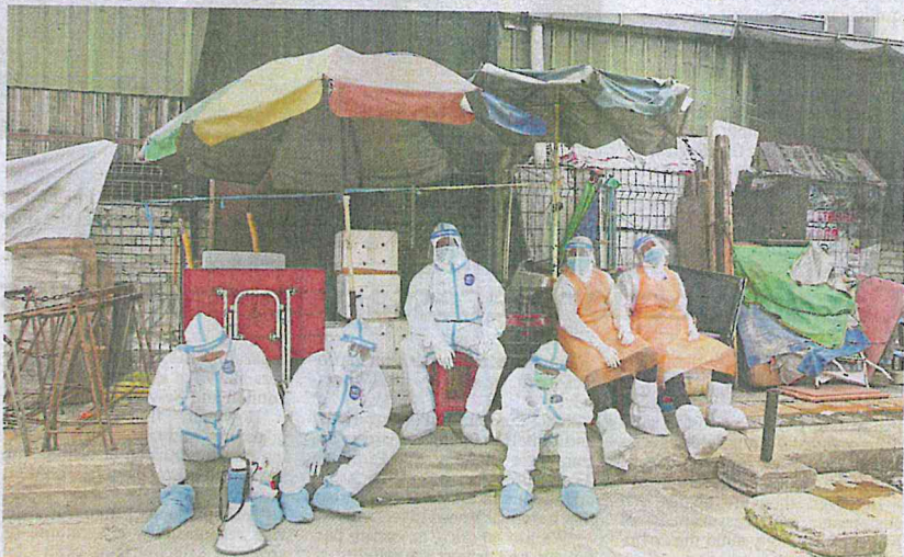
Taking a breather: Healthcare workers taking a break at Pudu market.