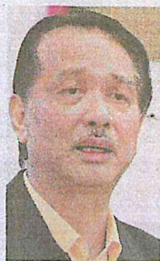
Datuk Dr Noor Hisham Abdullah

The death toll remained at 108, or 1.62 per cent, from total cases, with no new deaths reported up to noon yesterday, according to the National Crisis Preparedness and Response Centre.